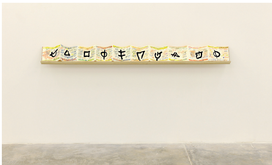
Etel Adnan, Al Hajj , 2023. Leporello: ink, watercolor and pencil on paper. Cover: 7 × 7 4/5 in.; 20 folded pages: 7 × 12 in. each; max. extension: 94 1/2 in. Collection of Oscar and Carole Seikaly.