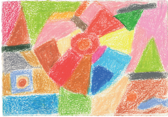
Etel Adnan, Untitled, 2020. Crayon on paper. 8 × 12 in. Sketch for a ceramic mural, catalogue raisonné number D93.